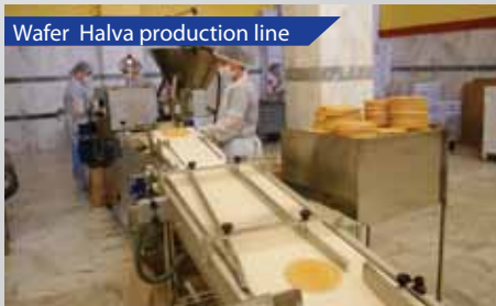
Wafer Halva production line