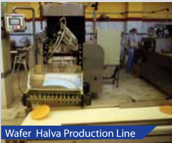
Wafer Halva Production Line