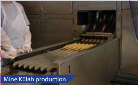
Mine Külah production