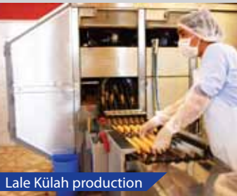
Lale Külah production